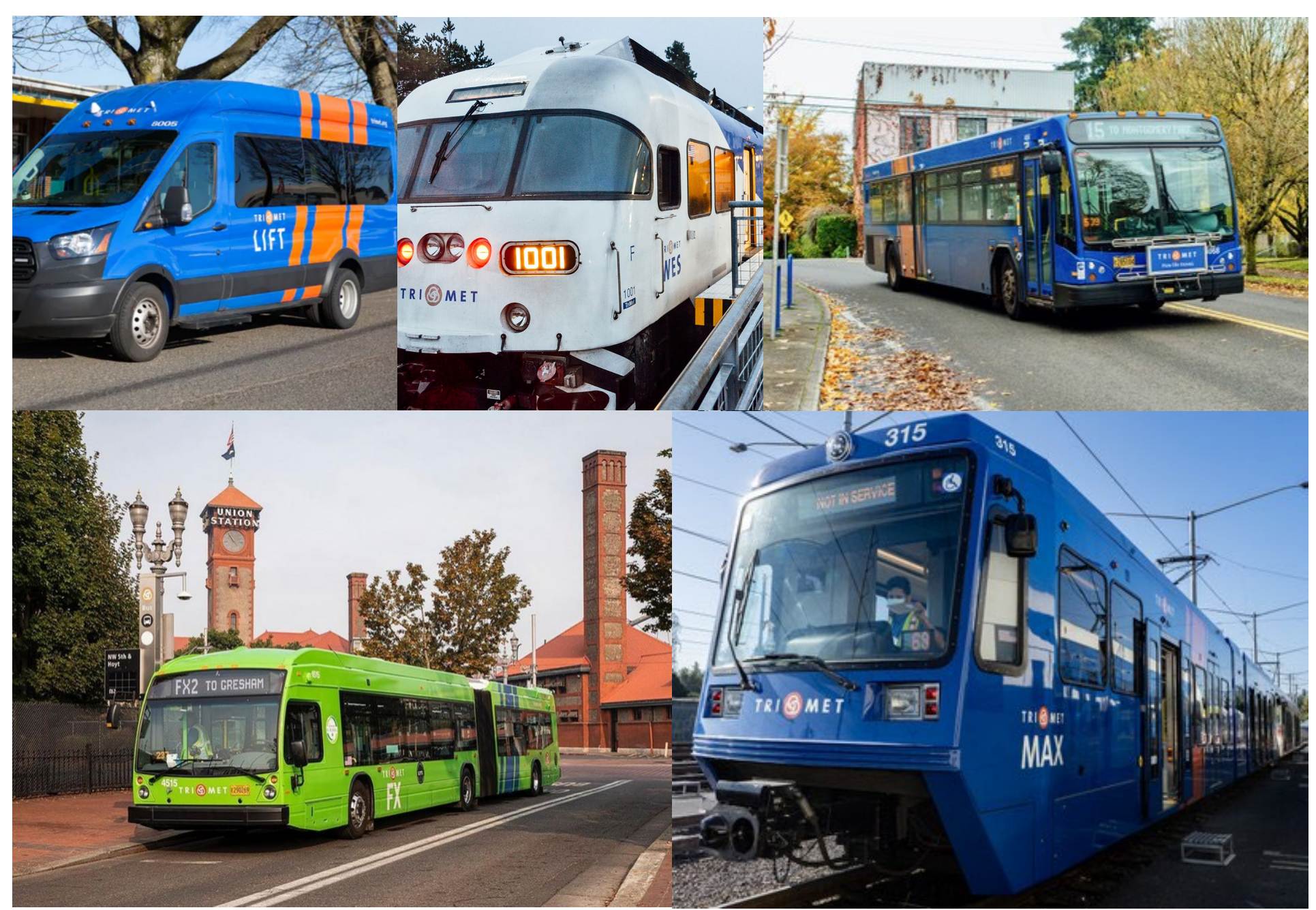
38 TRIMET BUSINESS PLAN FY2025 - FY2029